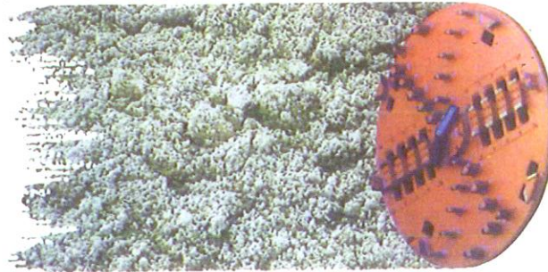
Ordinary soil Hard soil