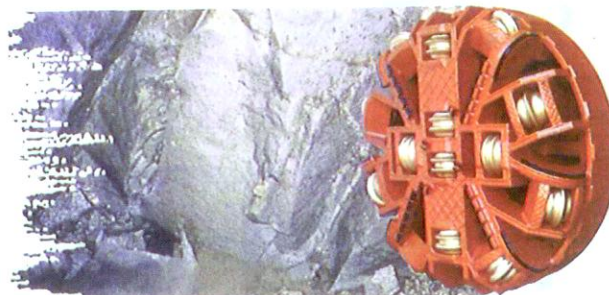
Medium hard rock